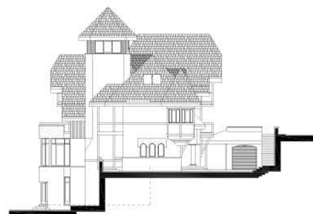
FATADA LATERALA STANGA